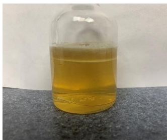
Image 1: Example test bottle injected with hydraulic fluid sample.

Note: distinct layers may be observed in the test bottle once the sample is injected.